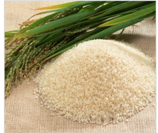
Mushk Budji

1. Mushk Budji - It is a short and aromatic rice grown in the higher regions of the Kashmiri Valleys. The cooked rice possesses a harmonious blend of taste, aroma and rich organoleptic properties (stimulates the sense organs). It is mainly grown in the areas of Sagam, Panzgam and Soaf Shali of district Anantnag and Beerwah belt of district Budgam.