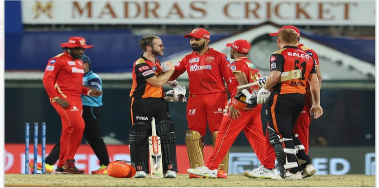
Sunrisers Hyderabad clock their first win in IPL 2021

The match between Chennai Super Kings and Kolkata Knight Riders is currently underway.